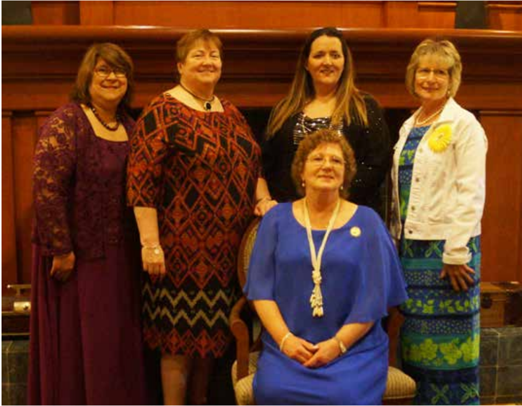
2017-2018 Executive Committee members were installed at the recent 96th Annual State Conference held at the Hilton Garden Inn in Joplin. New state officers for the Business Women of Missouri are: center front Presi-